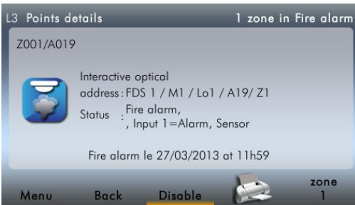
Details of a point