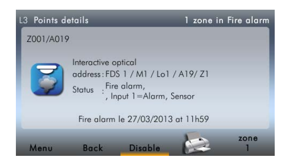
Details of a point